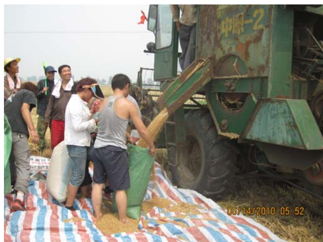
Winter wheat harvest, June 14, 2010 – Hebei

the newly-emerged crop into premature dormancy and weakened its resistance to freeze damage. Below-normal temperatures and heavy snowfall in the spring delayed the resumption of winter wheat growth by several weeks and hindered the planting of spring wheat in northeast and northwest China.