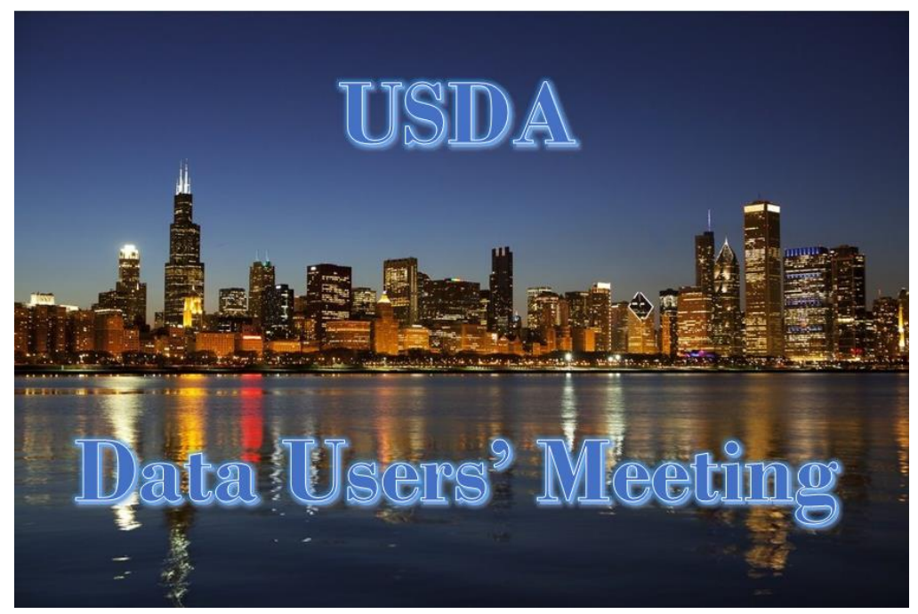
USDA NASS Data Users' Meeting Tuesday, April 24, 2018

University of Chicago – Gleacher Center 450 North Cityfront Plaza Drive Chicago, Illinois 60611 312-464-8787